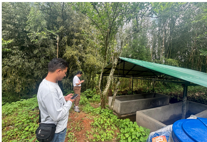
Site Inspection of Ongoing work